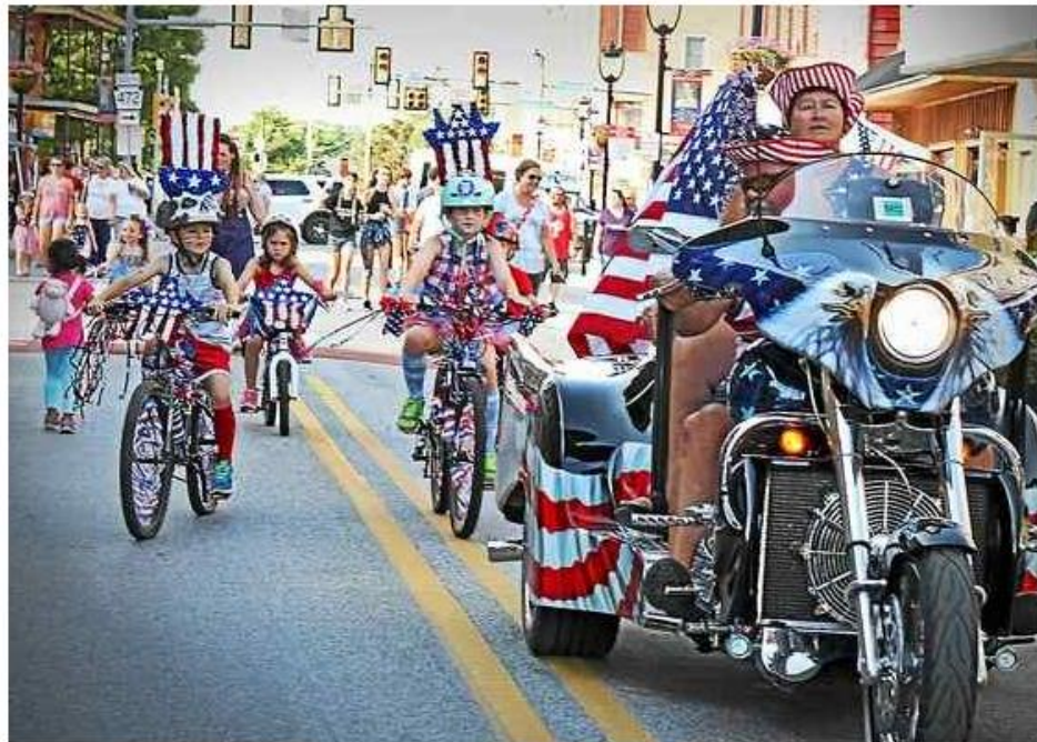
Kids ride their celebratory bikes down Third Street behind the pace motorcycle on Friday.