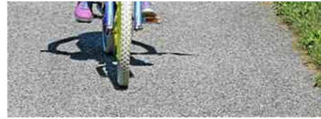
Riders pedal down the path at Goddard Park for the Avon Grove Library Bicycle Parade.

The Friday night parade was sponsored by Oxford Mainstreet. The Saturday morning event was sponsored by the Avon Grove Library.